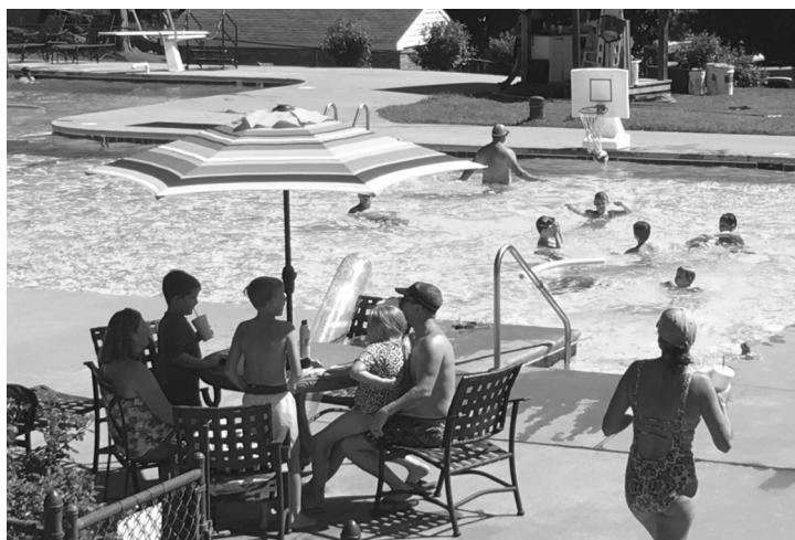
Fun at the Pool