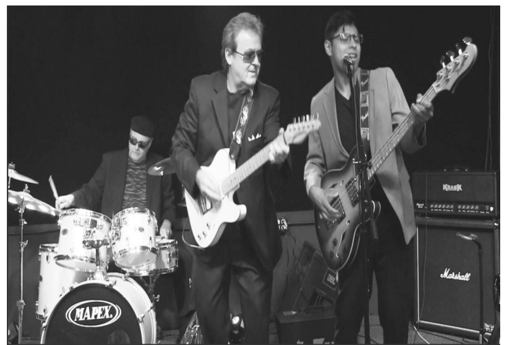
Heart Beat of Soul at Member Guest