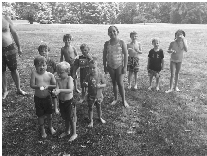
Fun at the Pool